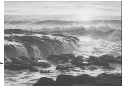
COLORED PENCIL ARTWORK BY PAT AVERILL

Listen to the pounding surf and watch the sparkling light constantly change over the waves... how does an artist ever capture the chaotic movements of the sea? In this workshop, participants will explore the dynamics